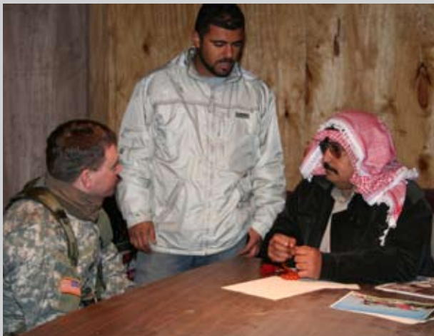
During Phase IV students train in real-world scenarios at the two-week cumulative exercise.